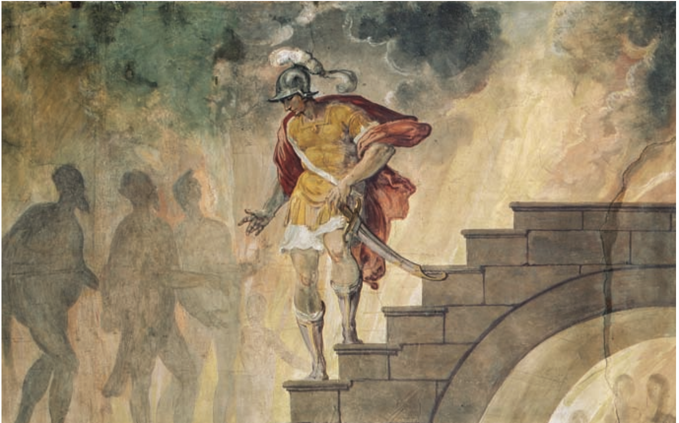
Ulysses Descending into the Underworld (16th century), Giovanni Stradano. Fresco. Palazzo Vecchio, Florence.

‘How is this, Elpenor, 30 how could you journey to the western gloom swifter afoot than I in the black lugger?’