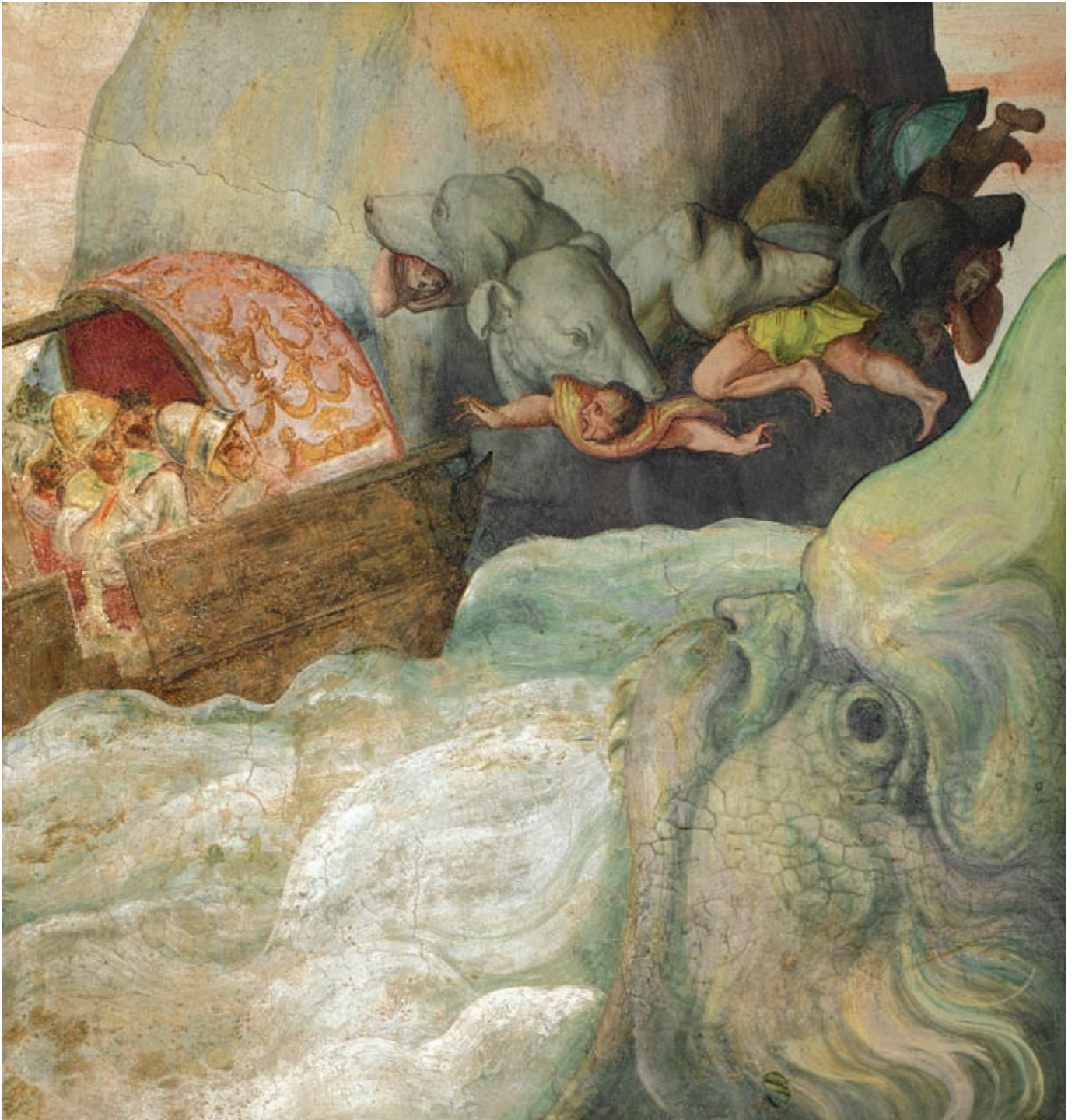
Scylla and Charybdis from the Ulysses Cycle (1580), Alessandro Allori. Fresco. Banca Toscana (Palazzo Salviati), Florence.