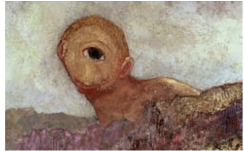
The Cyclops (c. 1914), Odilon Redon. Oil on canvas. Kroller-Muller Museum, Otterlo, Netherlands.

When the young Dawn with fingertips of rose lit up the world, the Cyclops built a fire I and milked his handsome ewes, all in due order,