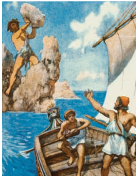
Detail of Odysseus and Polyphemus (1910), after L. du Bois-Reymond. Color print. From Sagen des klassischen Altertums by Karl Becker, Berlin.

This 1910 color print depicts Odysseus taunting Polyphemus as he and his men make their escape.