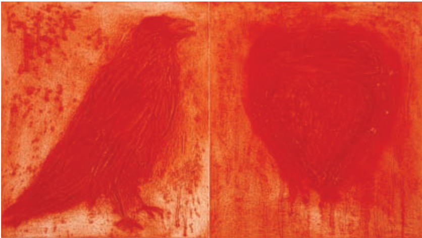
Red Passion (1996), Jim Dine. Cardboard relief intaglio. Image size 33 1/8" × 59". Paper size 39 1/2" × 63 7/8". Published by Pace Editions, Inc. Edition of 12. © 2007 Jim Dine/Artists Rights Society (ARS), New York.

85 “Prophet!” said I, “thing of evil!—prophet still, if bird or devil!— Whether Tempter sent, or whether tempest tossed 15 thee here ashore, Desolate yet all undaunted, 16 on this desert land enchanted— On this home by Horror haunted—tell me truly, I implore— Is there— is there balm in Gilead? 17 —tell me—tell me, I implore!” E 90 Quoth the Raven, “Nevermore.”