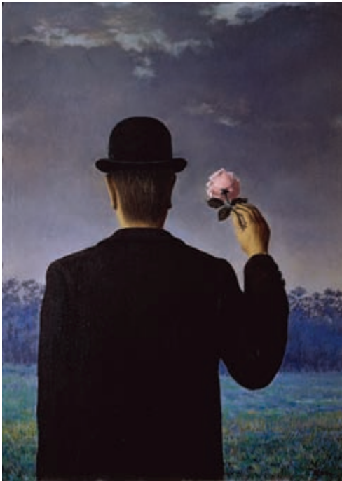
The Back of a Man with a Rose, René Magritte. Private Collection Bloch, Santa Monica, CA.

The gardener came running, An old man, out of breath. Fear had given him legs.